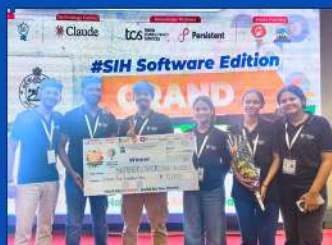
Team Augmentors Creators won the Smart India Hackathon 2025 (Software Edition) for their innovative project, "AR-Based Cultural Heritage Preservation Platform" at VSSUT Burla.