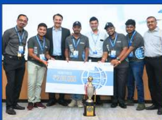
Team MetaAchievers secured 2 nd Runners-Up at the Infosys Global Hackathon 2025 with their AI & AR/VR-powered platform, SkillBridge.