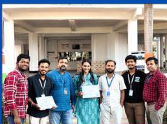
Team MetaAchievers won the Best XR Innovation Award for Mahakumbh VR Experience at the prestigious FICCI BAF Awards 2025 in the Best Use of XR in Education/Tourism.