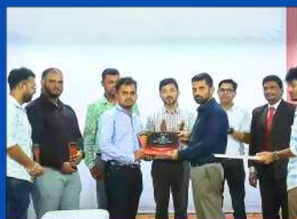
Heartiest congratulations on achieving 1st position in the Best Presentation Award at the ZSI Hackathon Level 1 (Regional) on the theme "Mangrove Biodiversity".